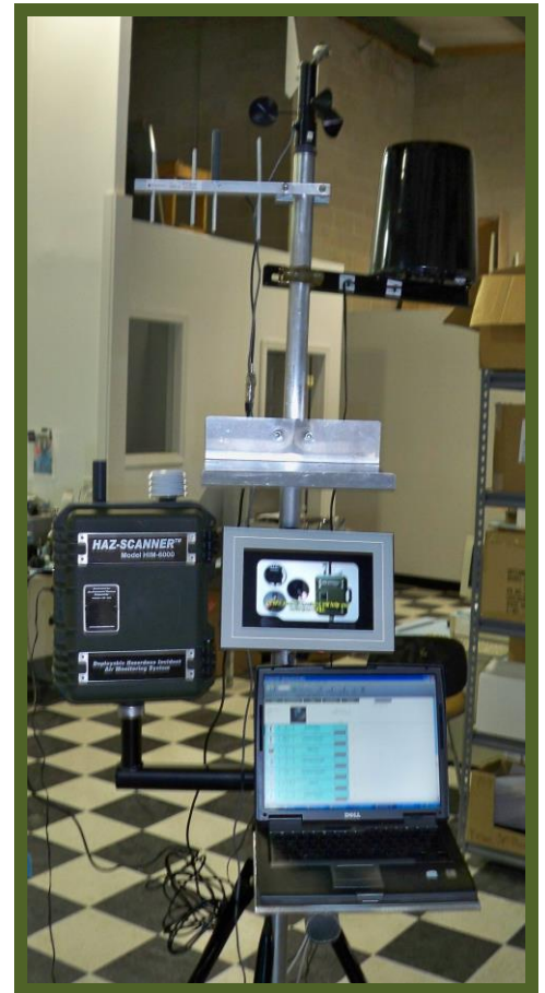
Model: HIM-6000 Shown with optional tripod stand and rain gage